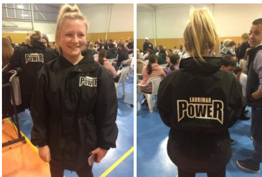
Club Winter Jacket $75

Club Winter Jackets are available as shown in sizes S to XXL for $75. These are great for those cold days and nights on the side of the court!