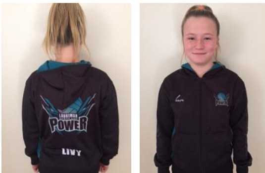
Silky Club Jacket - $60