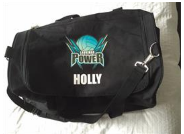
Club Bag with Name Printed - $40

http://laurimarpowernetball.com/uniforms-merchandise