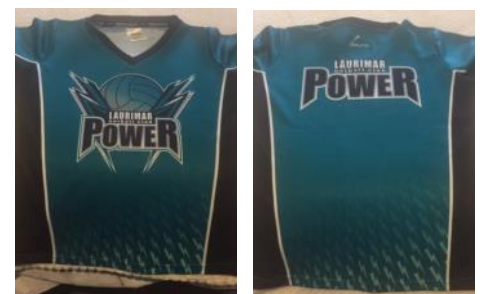
Senior V-Neck T Shirt $35

http://laurimarpowernetball.com/uniforms-merchandise