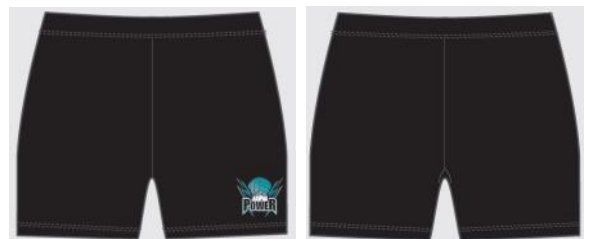
Bike Shorts - $30

Web: laurimarpowernetball.com Team App: laurimarnetballclub.teamapp.com Facebook: facebook.com/laurimarNetballClub