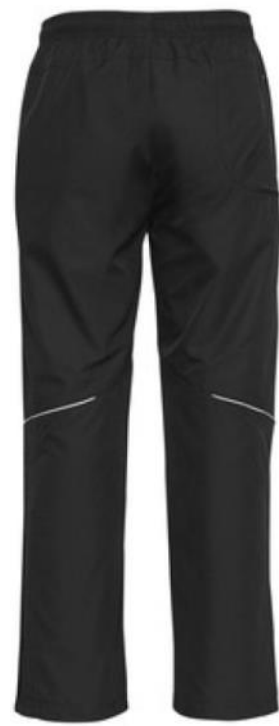
Track Pants - $35

You can have a name printed on the back of the jacket for an additional $5. Provide details of the name to be printed at the time of order.