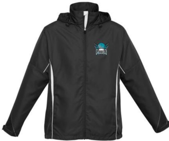
Zip Up Track Jacket Front - $50