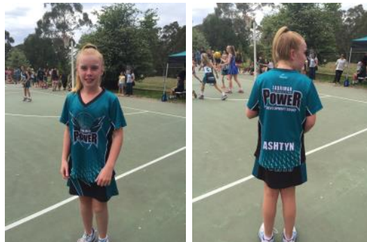
Club Training T-Shirt (Teal) - $35