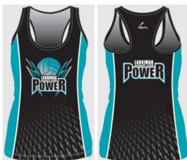
Training Singlet in Black $35 with name printed