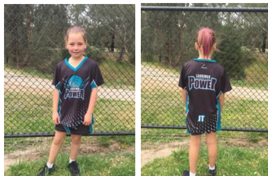
Club Training T-Shirt (Black) - $35