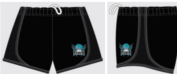
Training Shorts - $35

Need some shorts for training? We have those as well...go to our website for details and size charts.