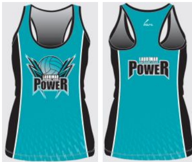
Training Singlet in Teal $35 with name printed

We have added club training singlets to the line up in teal and black versions.