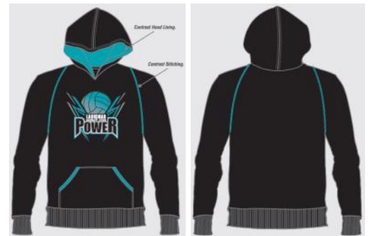
Raglan Sleeve Zipper less Hoodie $55 with name printed