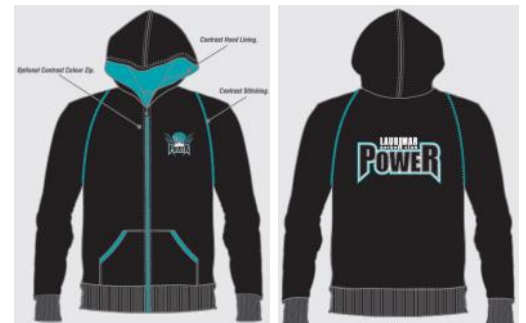
Raglan Sleeve Zip Through Hoodie $65 with name printed