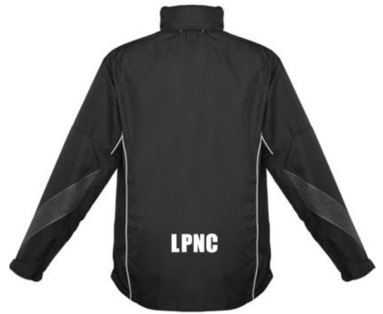
Zip Up Track Jacket Back - $50